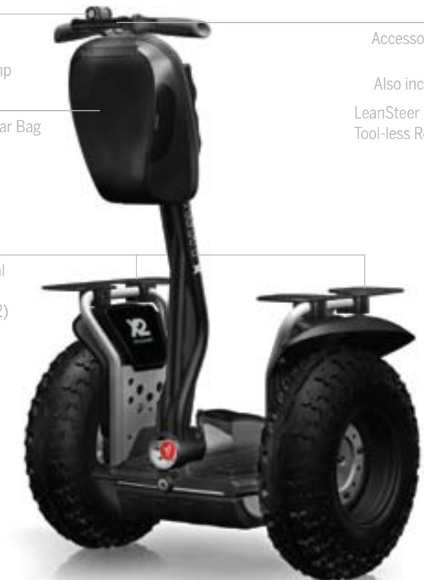
Also included: LeanSteer Frame Tool-less Release