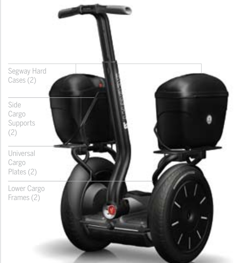
Segway Hard Cases (2)